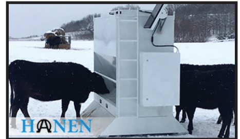
Save time with automatic programmable feeding.