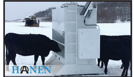
Save time with automatic programmable feeding.