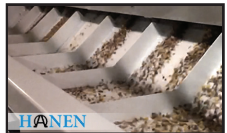
Automatic feeding cycles

Fill the Hopper. Set the Timer. Precision Feeding!