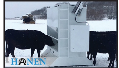
Save time with automatic programmable feeding.